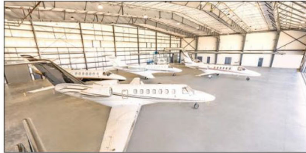
Desert Jet Hangar

She added, "pets are welcome in all Desert Jet planes and FBO facilities." Desert Jet continues to support local charities as well, in the past, raising an average of $50,000 annually for organization such as St. Jude's